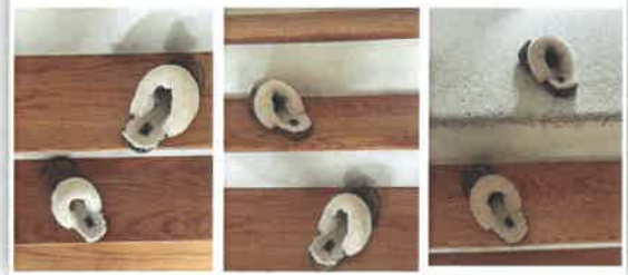
After a long day, we go to bed