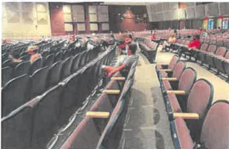
4. Teachers' workshops are very, very socially distant!