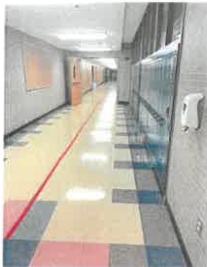
2. Stay on either side of the red line