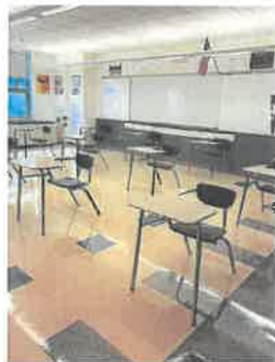
5. And so are classrooms!!!