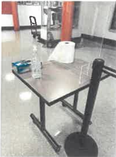
1. Sanitize your hands at AMS