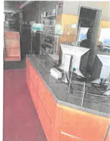
3. Stand behind the Plexiglass