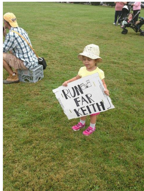
The fans were out to cheer on the athletes!