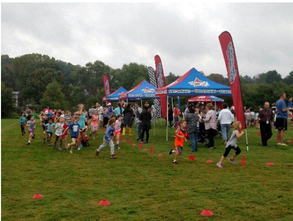
Many students ran over 30 laps in this FunRun.